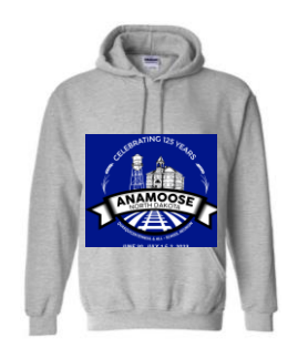
Pull-Over Hoodie $40.00