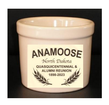
Pint-Sized Crock 3 ½" tall by 4 ¼" wide $15.00