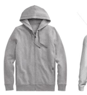
Full-Zip Hoodie $45.00