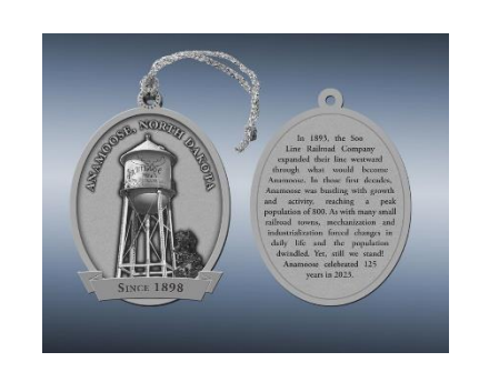
Water Tower Ornament pewter 15.00

Clothing: unisex, mostly 60/40 poly/cotton blends; sweatshirts, medium weight