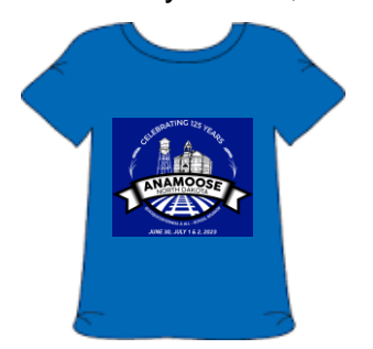
Short Sleeve T-Shirt $20.00

Colors: Royal Blue, Black, Sport Gray (light) logo background will be the color of the shirt