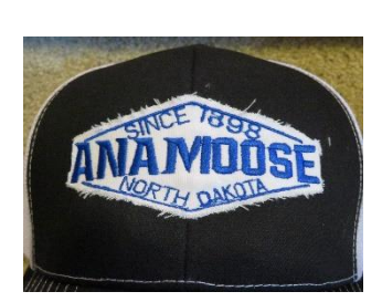
Cap (design may change slightly) $20.00