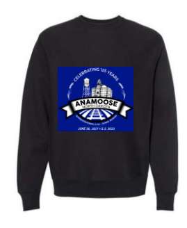
Crew-Neck Sweatshirt $30.00