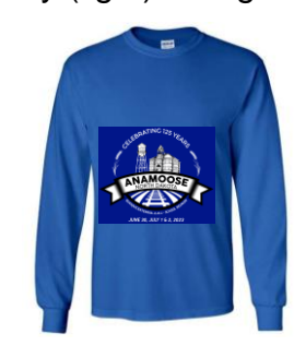
Long Sleeve T-Shirt $25.00